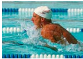
With HD Color technology