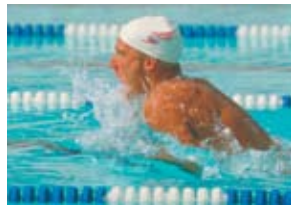
Without HD Color technology

With its standard 40 GB hard disk drive, the CX2633 MFP provides enhanced security—Encrypted Secure Print 3 — that includes: