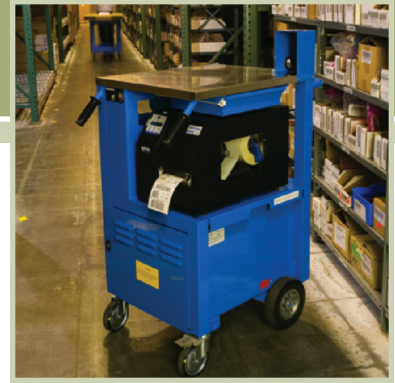
Shown with T5000r™ printer (not included)