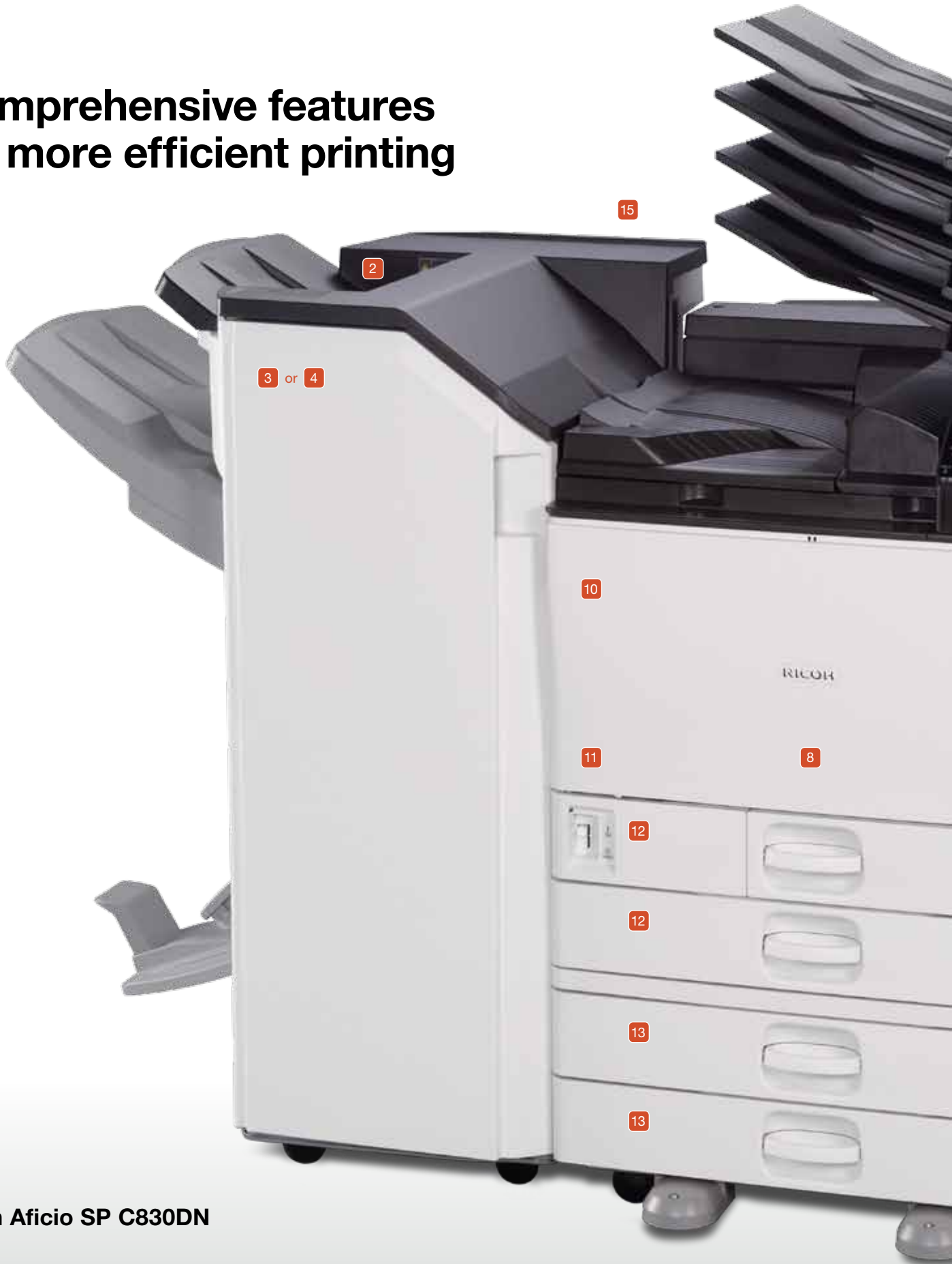
Ricoh Aficio SP C830DN